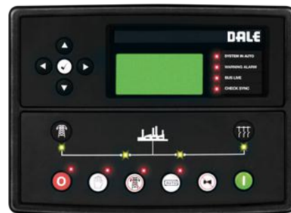
Image shows control module only