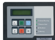
PowerStart 500 control operator/ display panel

PC tool interface: This RS-485 communication port allows the control to communicate with a personal computer running InPower software. Note – An RS-232 or USB to RS-485 converter is required for communication between PC and control.